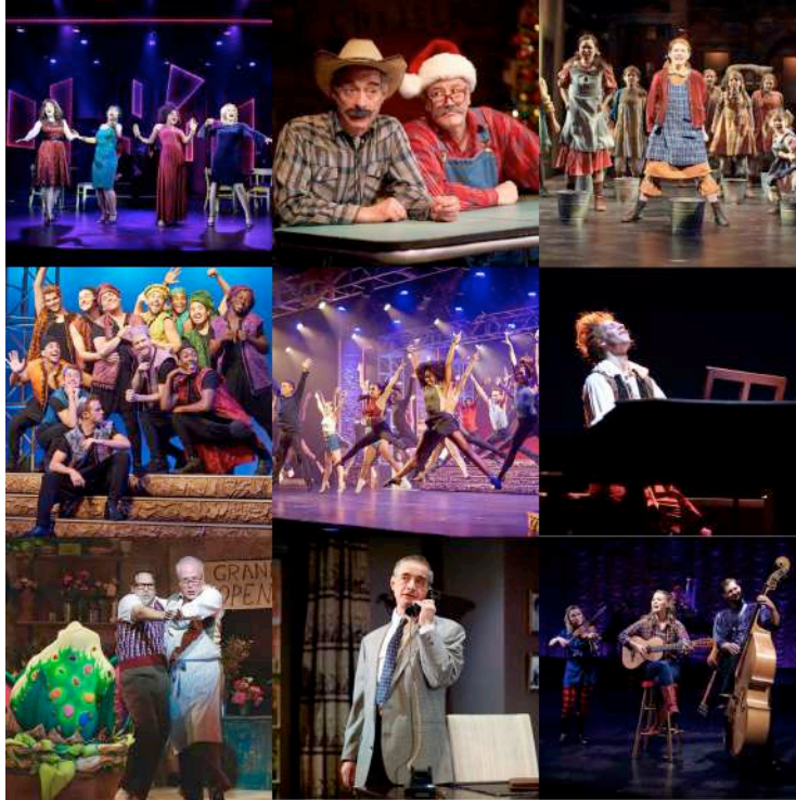
Flat Rock Playhouse Collage of Shows