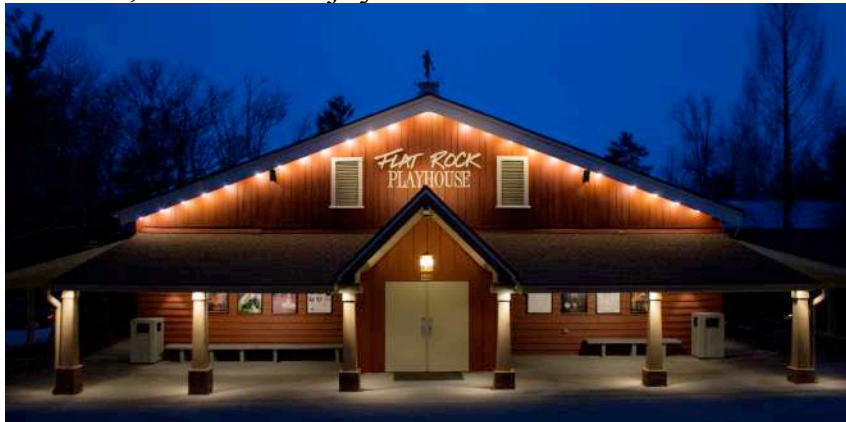
Flat Rock Playhouse Mainstage

Arrive at Flat Rock Playhouse ( www.flatrockplayhouse.org ) for an evening of Broadway style entertainment with a show selected especially for your group. Flat Rock Playhouse has been entertaining guests for years. This professional equity theater provides quality entertainment for audiences young and old alike with comedies, musicals and dramas. Sit back, relax and enjoy the show!