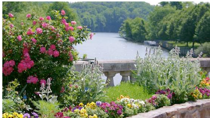
Lake Lure Flowering Bridge