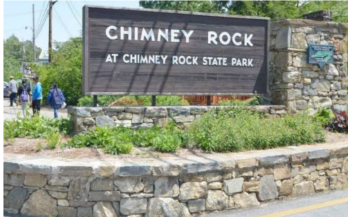
Chimney Rock State Park

Only minutes from Lake Lure, Chimney Rock offers the best of the mountains in one place – spectacular 75-mile views, hiking trails for all ages, a 404-foot waterfall, special programs for groups and more.