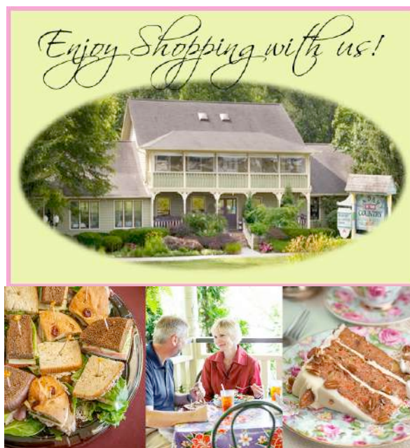
A Day in the Country with Café on the Veranda

Allow time for shopping after lunch in the 10,000 square gift and boutique shop!