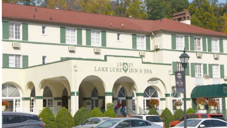
Lake Lure Inn

Over the years, the Inn has hosted a range of celebrities from F. Scott Fitzgerald, Franklin D. Roosevelt, Calvin Coolidge to Patrick Swayze and Jennifer Grey during the filming of Dirty Dancing .