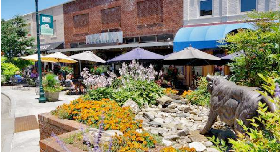
Downtown Hendersonville, NC