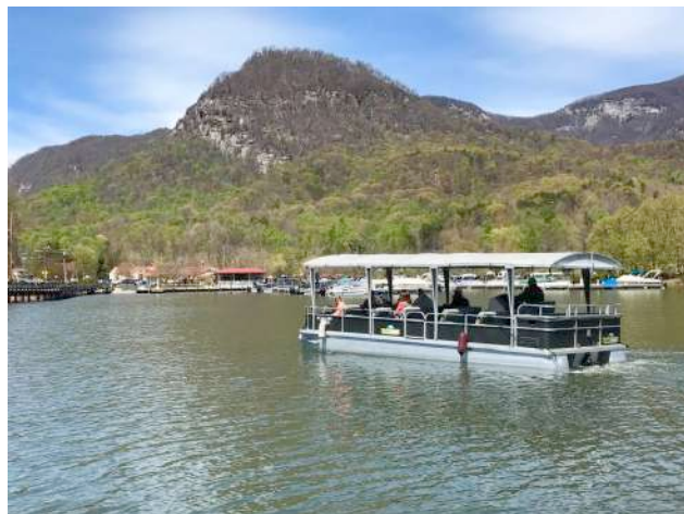
Lake Lure Boat Tours

Discover the beauty and charm of Lake Lure. Relax on one of our covered tour boats while your skipper guides past local attractions and landmarks such as the locations used in filming the popular Dirty Dancing and the recently restored historic 1927 Lake Lure Inn and Spa. Listen to the legends and learn about the natural and cultural history of Hickory Nut Gorge, home to Lake Lure, North Carolina.