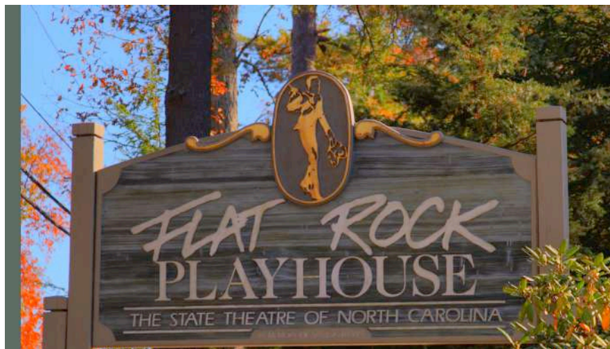
Flat Rock Playhouse Mainstage Entrance