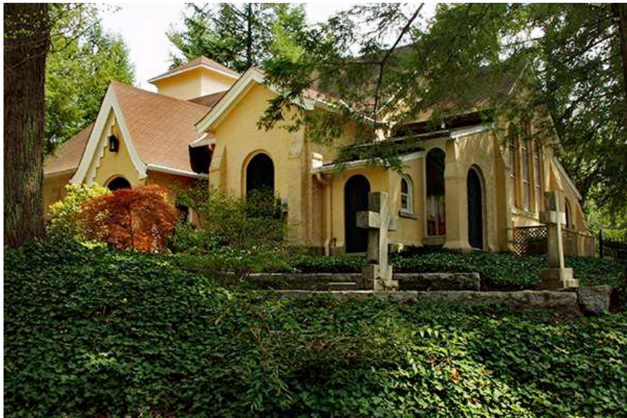
St. John in the Wilderness Church